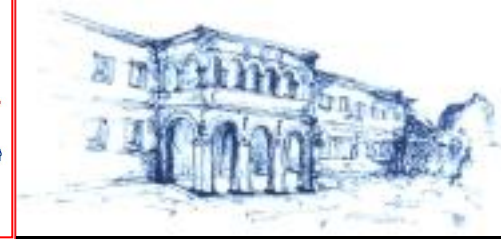
Istituto Ortopedico Rizzoli