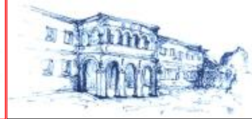
Istituto Ortopedico Rizzoli